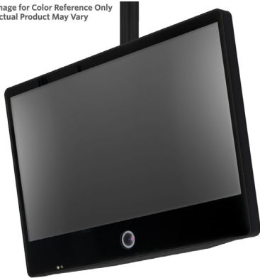
Image for Color Reference Only Actual Product May Vary