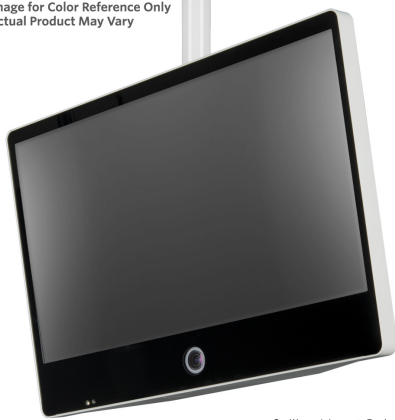
Ceiling Mount Pole Shown Not Included

Image for Color Reference Only Actual Product May Vary