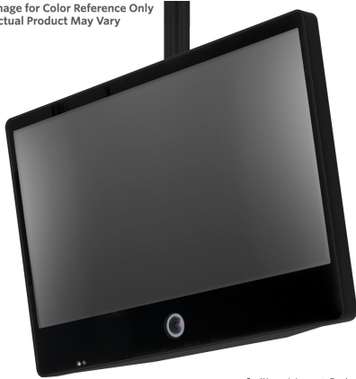
Ceiling Mount Pole Shown Not Included

Image for Color Reference Only Actual Product May Vary