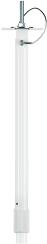
▲ CE-CP6W (Compressed)