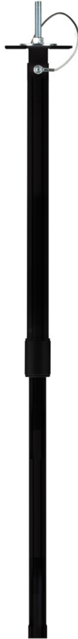
▲ CE-CP6B (Extended)