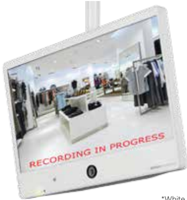
*White Front / White Cabinet