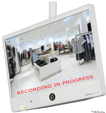
*White Front / White Cabinet

27" IP Public View Monitor w/ AXIS IP Camera