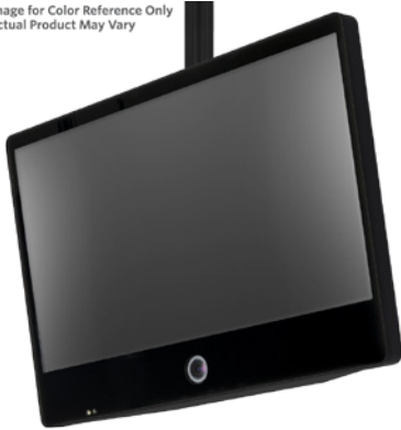
Image for Color Reference Only Actual Product May Vary